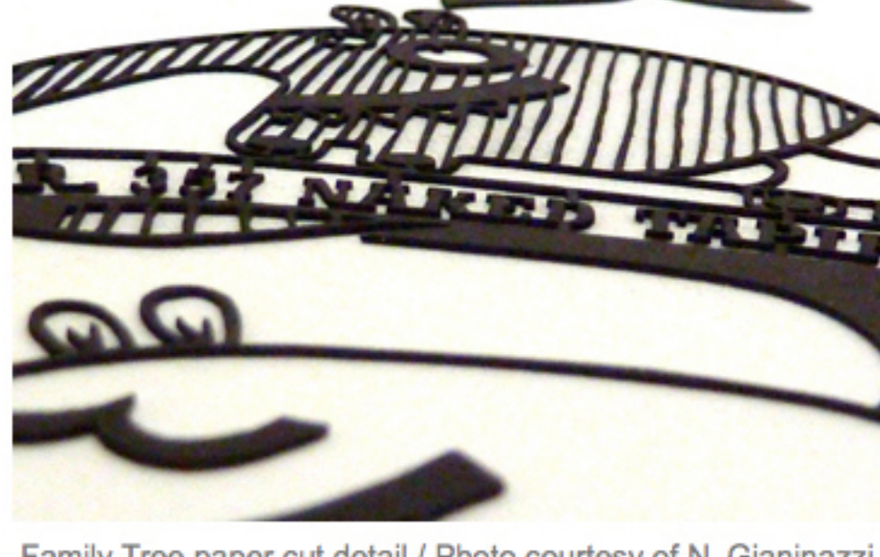
Family Tree paper cut detail