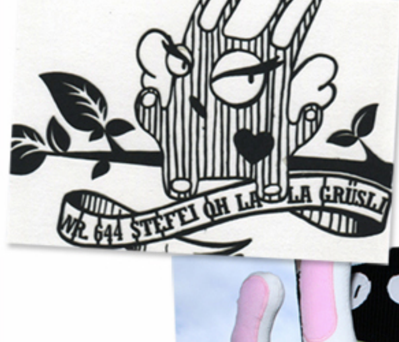
nr. 644 Steffi oh La La Grösli Original Art Card by Natalia Gianinazzi